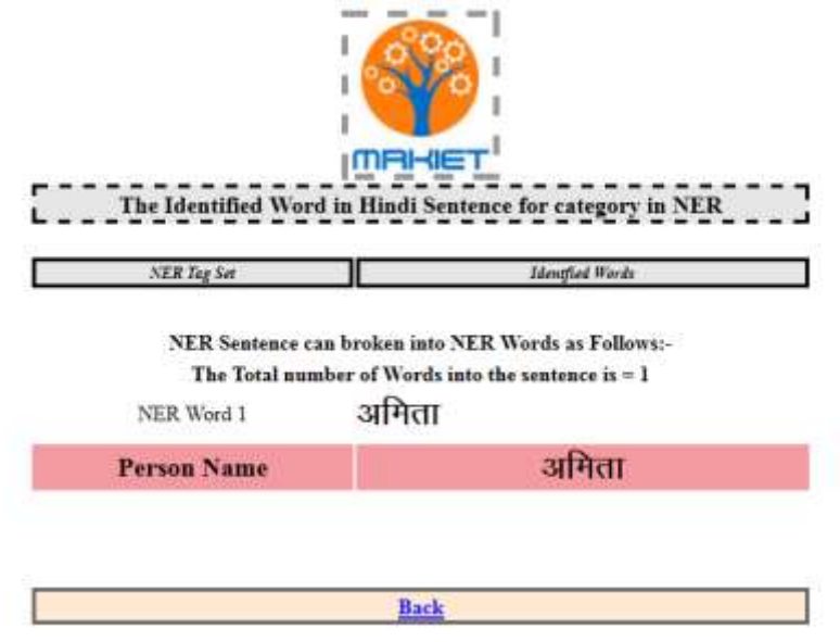
Figure 4 Result of NEPH (Person-Hindi)

The result obtained for NEPH(Named Entity Person-Hindi) is shown as below.