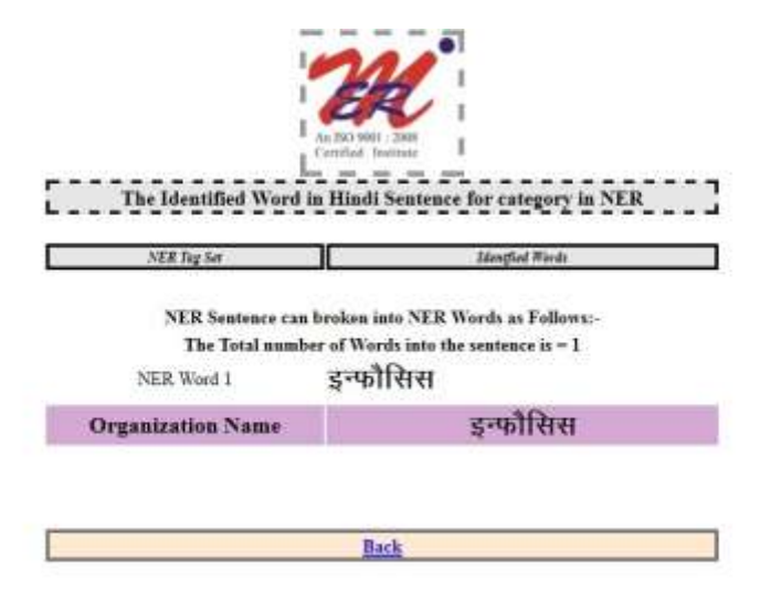
Figure 5 Result of NEOH (Organization-Hindi)

The result obtained for NEOH(Named Entity Organization-Hindi) is shown in the below figures.