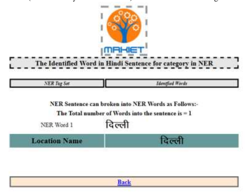
Figure 6 Figure 6.9 Result of NELH (Location-Hindi)

The result obtained for NELH(Named Entity Location-Hindi) is shown in the below figures.