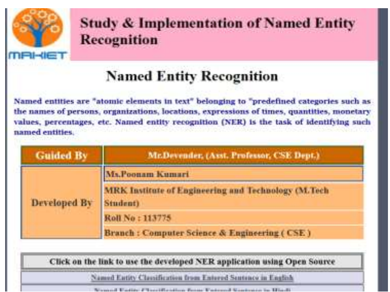
Figure 2 Gateway of NER Application using Open Source

The developed NER system in PHP for Hindi can be shown in the below figure. The developed system for HINDI will recognize the Named Entities written in Hindi.